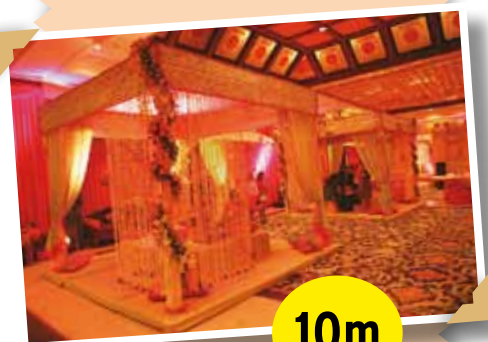
The estimated annual growth of the industry