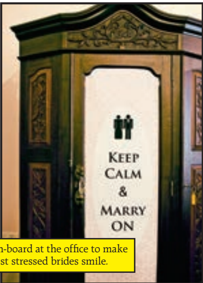
A funny sign-board at the office to make even the most stressed brides smile.

These white drapes need to go. We should get some red curtains instead.